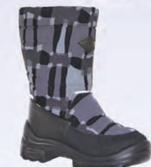
Black Big Square 1203 0352 Sizes: 20-39