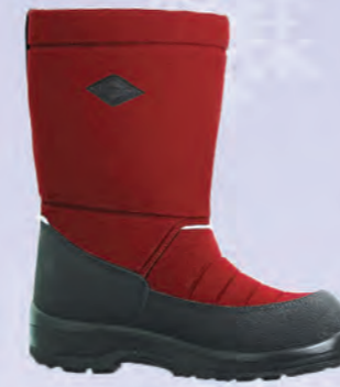
Bordeaux 1403 08 Sizes: 36-42