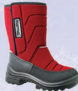
Bordeaux 1211 08 Sizes: 20-35