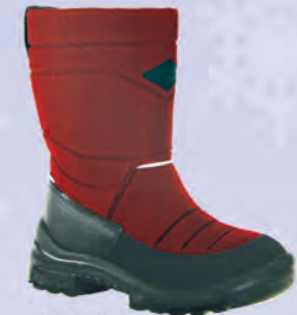
Bordeaux 1203 08 Sizes: 20-39