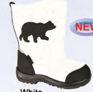
White 1502 13 Sizes: 23-35