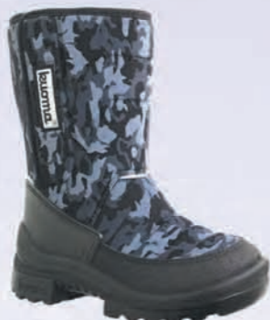
Black Ghost 1211 0337 Sizes: 20-35