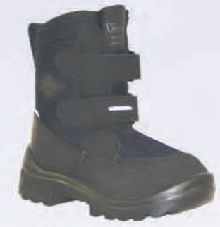
Blue 1260 19 Sizes: 22-35