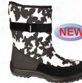
White Butterfly 1404 1368 Sizes: 36-42