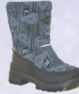
Black Woodgrain 1203 0355 Sizes: 20-39