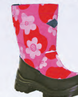
Cyclamen Flower 1203 4826 Sizes: 20-39