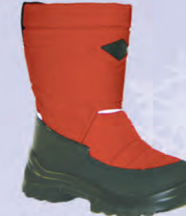
Red 1203 04 Sizes: 20-39