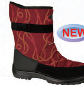
Bordeaux Pearl Gewgaw 1404 0866 Sizes: 36-42