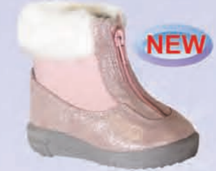
Pink Glitter 1241 5967 Sizes: 19-24