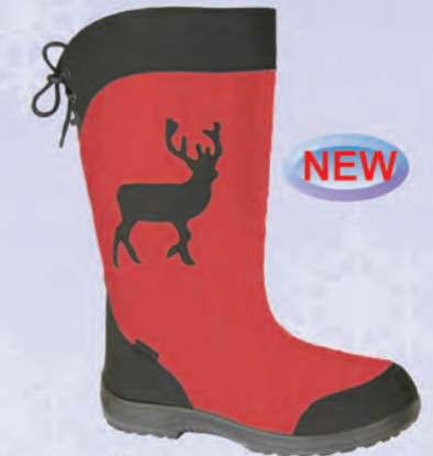
Red 1503 04 Sizes: 36-42