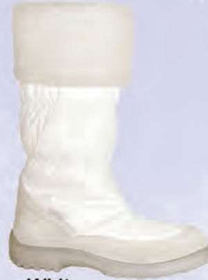
White 1410 13 Sizes: 23-42