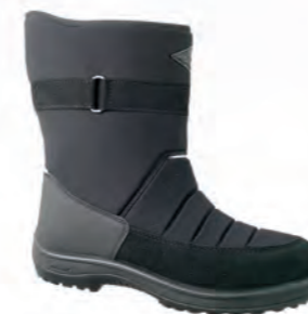
Black 1404 03 Sizes: 36-42