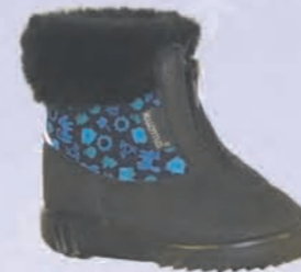
Blue Cats 1241 0109 Sizes: 19-24

Easy to put on for small children, zipper fastener