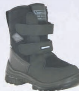
Black 1260 20 Sizes: 22-35