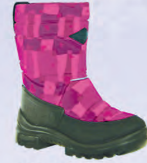
Pink Big Square 1203 3752 Sizes: 20-39