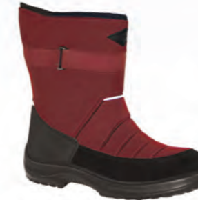
Bordeaux 1404 08 Sizes: 36-42