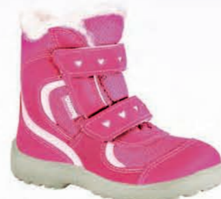
Fuxia 1925 40 Sizes: 23-35