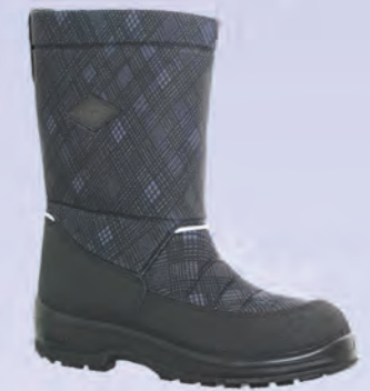
Gray Square 1403 1151 Sizes: 36-42