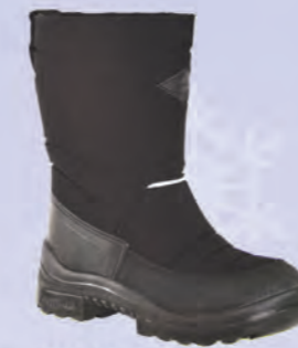
Black 1203 03 Sizes: 20-39