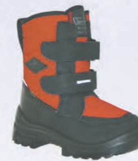
Red 1260 17 Sizes: 22-35