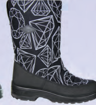
Black Diamond 1403 0365 Sizes: 36-42