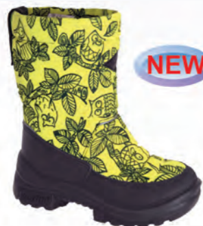
Neon yellow Owl 1203 6562 Sizes: 20-39