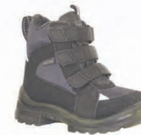
Blue 1915 19 Sizes: 28-40