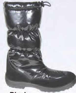
Black 1407 03 Sizes: 23-42