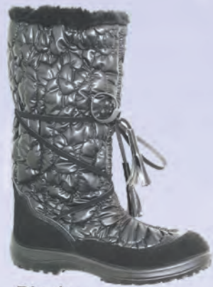
Black 1406 03 Sizes: 30-42