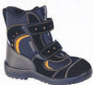
Black/Orange 1927 58 Sizes: 23-35