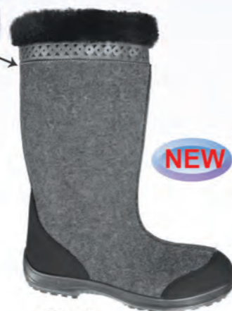
Black 1504 03 Sizes: 36-42