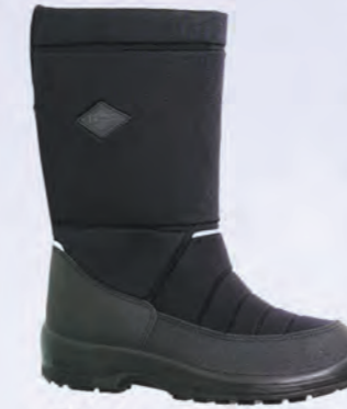
Black 1403 03 Sizes: 36-42