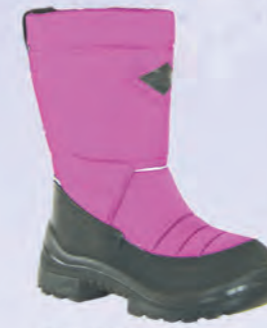
Cyclamen 1203 48 Sizes: 20-39