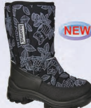
Black Owl 1211 0362 Sizes: 20-35