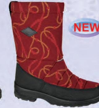
Bordeaux Pearl Gewgaw 1403 0866 Sizes: 36-42