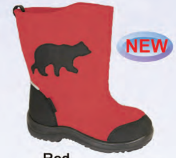
Red 1502 04 Sizes: 23-35