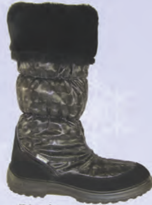
Black 1410 03 Sizes: 23-42