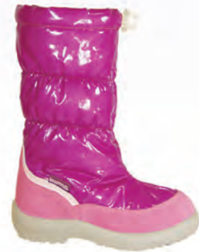
Pink 1407 57 Sizes: 23-42