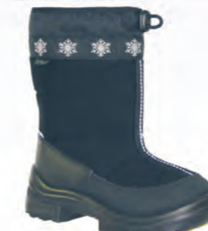
Black 1205 03 Sizes: 20-39