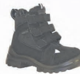
Black 1915 20 Sizes: 28-40