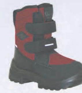
Bordeaux 1260 22 Sizes: 22-35