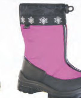
Cyclamen 1205 48 Sizes: 20-39