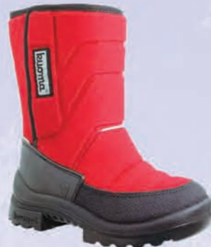
Red 1211 04 Sizes: 20-35