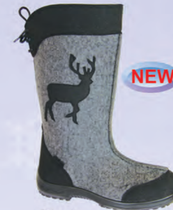
Black 1503 03 Sizes: 36-42