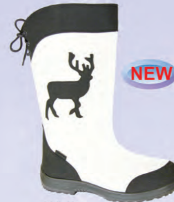
White 1503 13 Sizes: 36-42