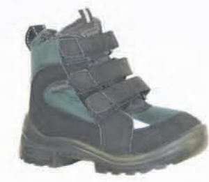
Green 1915 21 Sizes: 28-40