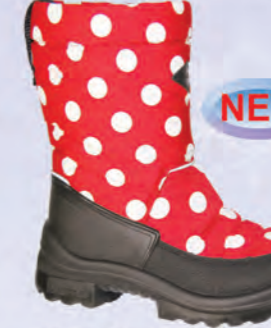
Red Point 1203 0464 Sizes: 20-39