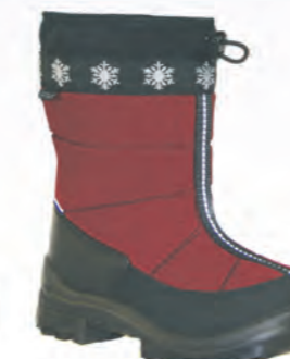
Bordeaux 1205 08 Sizes: 20-39