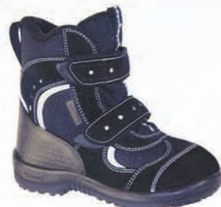
Black/Silver 1927 63 Sizes: 23-35