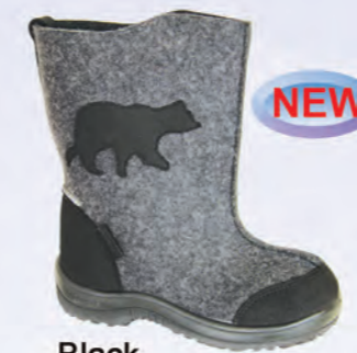
Black 1502 03 Sizes: 23-35