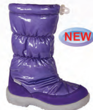
Purple 1407 56 Sizes: 23-42