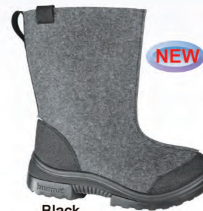
Black 1505 03 Sizes: 36-49