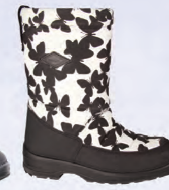
White Butterfly 1403 1368 Sizes: 36-42