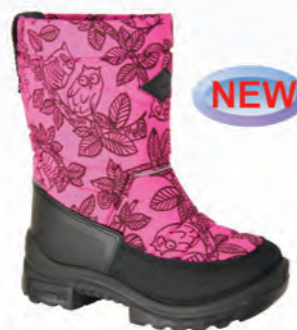
Neon pink Owl 1203 6662 Sizes: 20-39