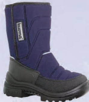
Blue 1211 01 Sizes: 20-35