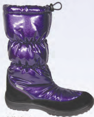
Violet 1407 02 Sizes: 23-42