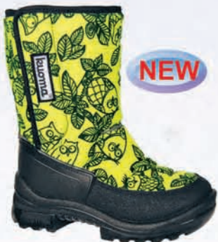
Neon yellow Owl 1211 6562 Sizes: 20-35