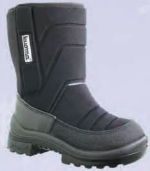
Black 1211 03 Sizes: 20-35