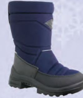
Blue 1203 01 Sizes: 20-39