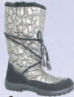
Gray 1406 11 Sizes: 30-42