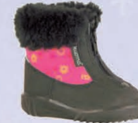
Cyclamen Cats 1241 4809 Sizes: 19-24