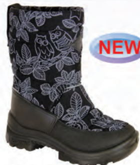
Black Owl 1203 0362 Sizes: 20-39