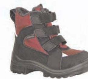
Bordeaux 1915 22 Sizes: 28-40