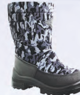
Black Ghost 1203 0337 Sizes: 20-39