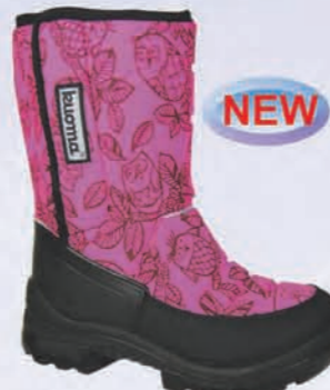
Neon pink Owl 1211 6662 Sizes: 20-35