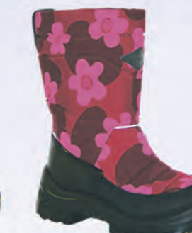
Bordeaux Flower 1203 0826 Sizes: 20-39