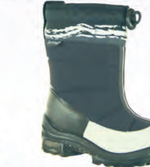
Black 1209 03 Sizes: 20-39