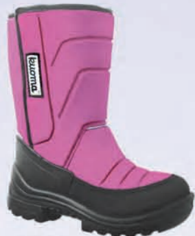
Cyclamen 1211 48 Sizes: 20-35