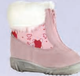
Pink Bunny 1241 5946 Sizes: 19-24