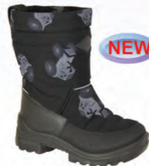
Black Tractor 1203 0363 Sizes: 20-39